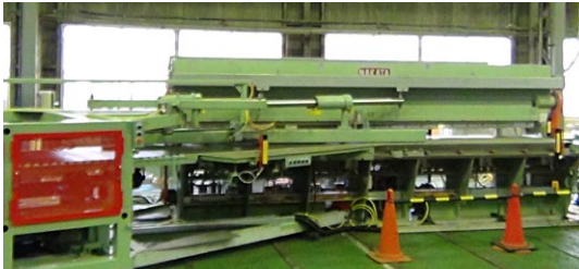
Steel Breaker Cutter with Auto Splicer

Extremely accurate, high speed cuts (15 cuts per minute, with 21-degree cuts and a width of 200 mm) are made possible by applying a highly reliable AC servomotor and highly accurate ball screw to the shear cutter developed through Nakata Engineering's cutting-edge technology and many years of experience. A newly designed mechanism also realized low noise. Through the use of an AC servomotor and high-accuracy ball screw in the joint apparatus as well, and the inclusion of a double zipper unit, this cutter is capable of high-speed, wide (up to 400mm) steel breaker cuts and joints. In addition to steel breakers, Nakata is also designing and producing auto joint and steel ply cutters, and supplying numerous cutters to the tire industry.